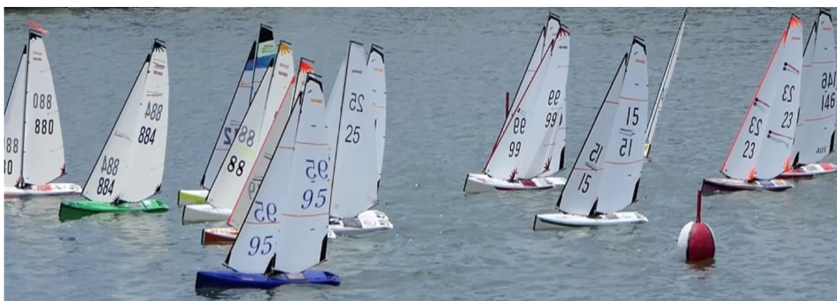
Current fine weather on the GC has seen large DF 95 fleet numbers at club sailing days